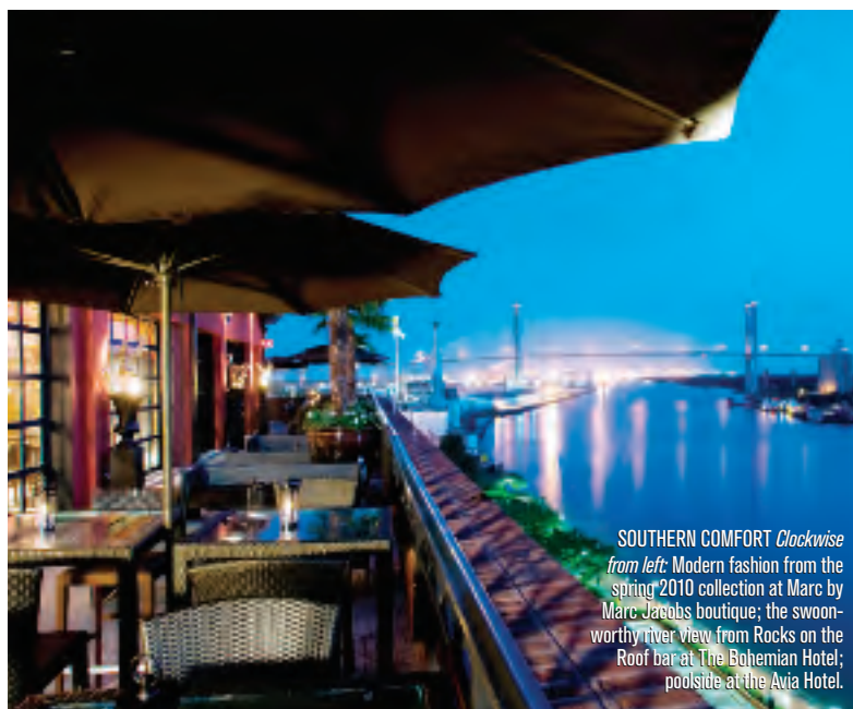
SOUTHERN COMFORT Clockwise from left: Modern fashion from the spring 2010 collection at Marc by Marc Jacobs boutique; the swoon-worthy river view from Rocks on the Roof bar at The Bohemian Hotel; poolside at the Avia Hotel.